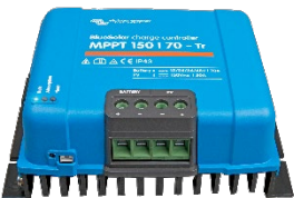
Solar Charge Controller MPPT 150/70-Tr