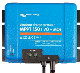
Solar Charge Controller MPPT 150/70-MC4