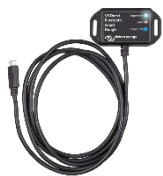
VE.Direct Bluetooth Smart Dongle